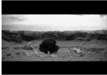
2001: A Space Odyssey

Example at right: First bone tool created (birth & civilization) + futuristic spaceship floating in space in the same shape as bone (future civilization) = History of civilization.